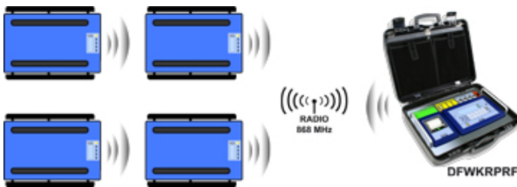
Example of application with 4 wireless platforms and DFWKRPRF indicator for the reading and printing of the weight through a remote indicator.

Wireless platforms designed for creating static wheel and axle weighing stations, avoiding the hassle of connecting cables between the platforms and the indicator. Ideal for weighing large sized vehicles fitted with twinned wheels (articulated lorries, tractor-trailers, building yard vehicles, etc.).