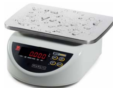
BW Series with Large pan accessory