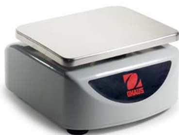
BW Series rear view