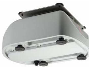
BW Series bottom view