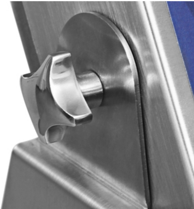
STAINLESS steel inclination adjustment system