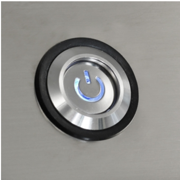
Well-finished in every detail, for harsh industrial environments