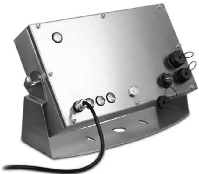
Rear panel configured for extra outputs